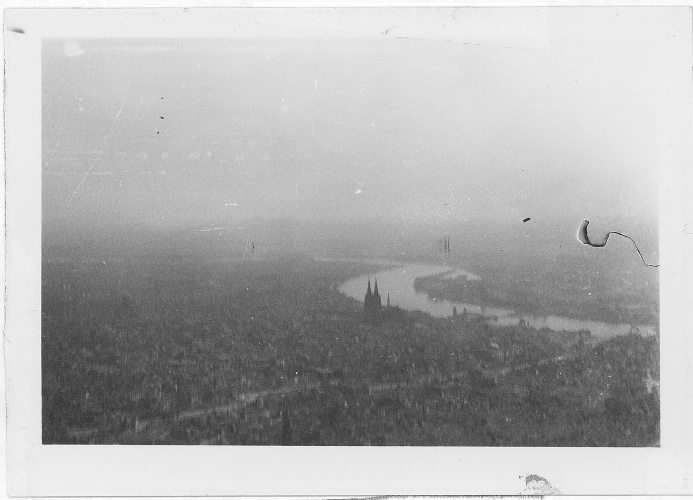
Colonge Germany 1945