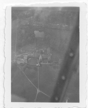
Castle - England 1945