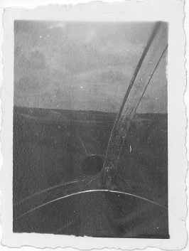
Coming in to land Base - England