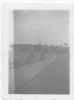
Park Lettering England 1945