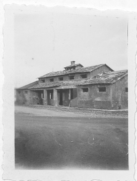
Base - France